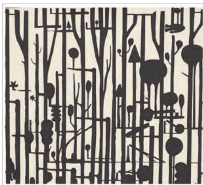
Left: Another inspirational image: Design*sponge