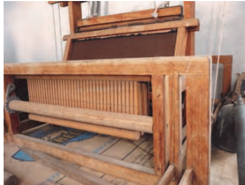
Weaving Loom not unlike my first & this was in the museum section.