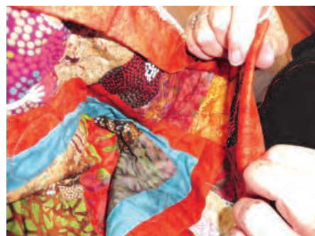
Quilting almost done!