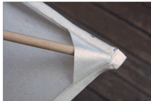
Left: Photograph 2: Close-up of reverse side of 2D sample