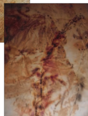
Sprig of Chilli Bush