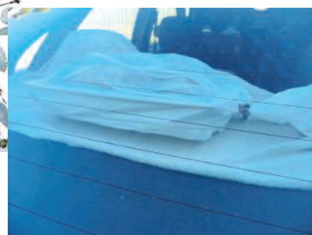
Into the Oven