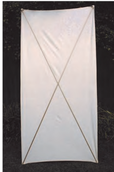
Left: Photograph 1: Reverse side of 2D sample

Phone: Anne Williams 9293 1931 or Louise Wells 9271 5796